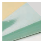
Almond Green Sand