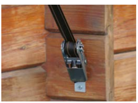
Tension ratchet with belt