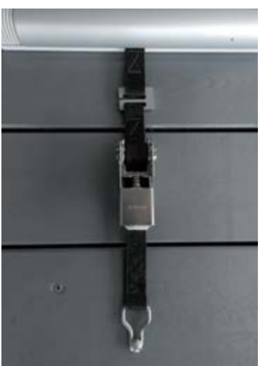
*Optional : Quick fastening System